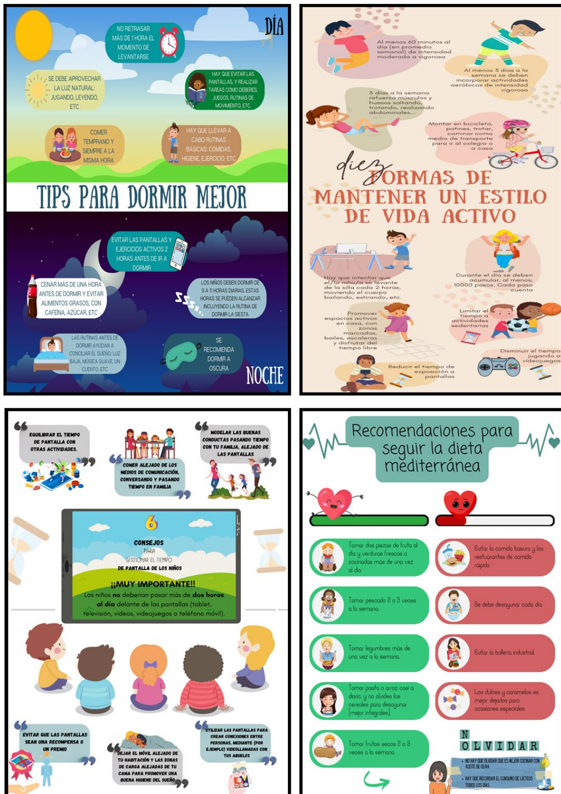
Figure 2. Examples of infographics used in the Archena Infancia Saludable project.

The length of the intervention (24 weeks during a school-academic year) falls within the time range used in the prior RCTs conducted on this topic (i.e., 20 weeks [41] and 60 weeks [42]). It has been previously described that when an intervention program is delivered, it can have a compensatory effect, so that participants discontinue other physical