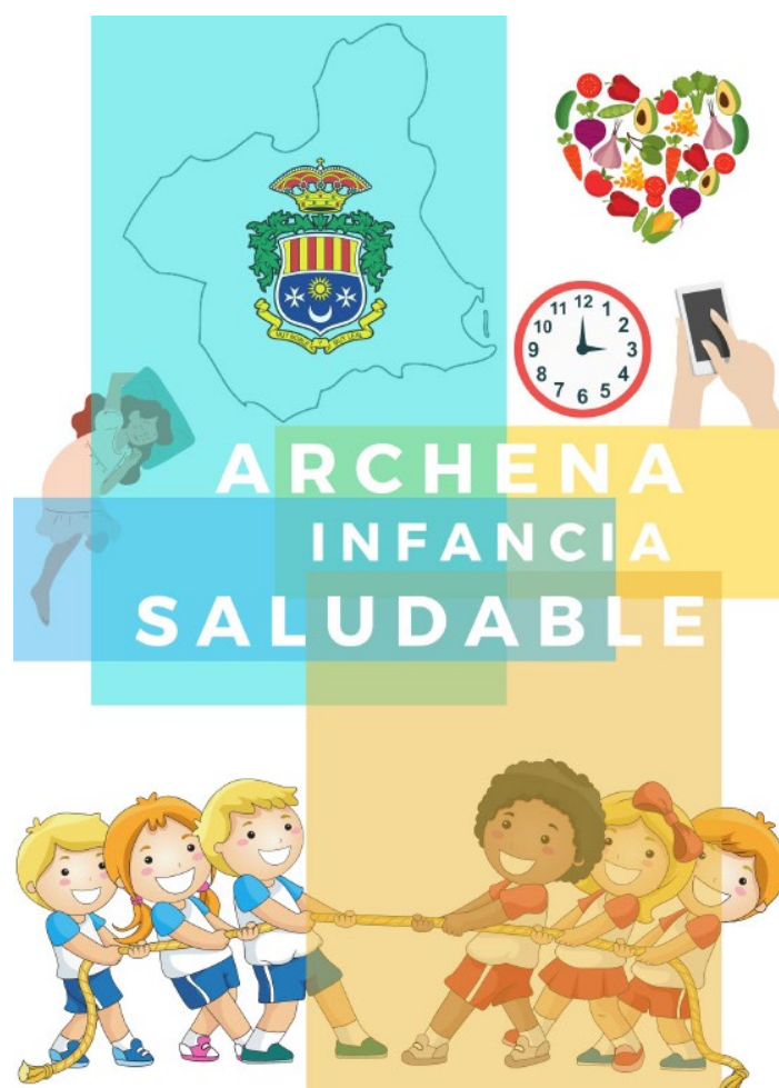
Figure 1. The Archena Infancia Saludable project.